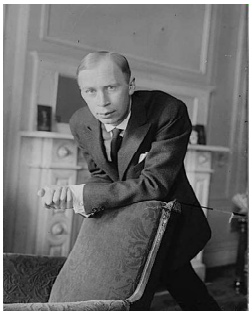
Sergei Prokofiev (1891-1953)