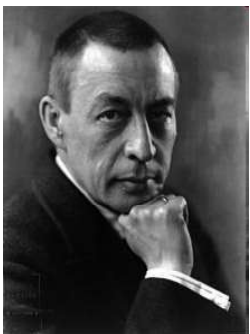
Sergei Rachmaninoff (1873-1943)