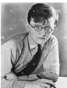
Dmitri Shostakovich (1906-1975)